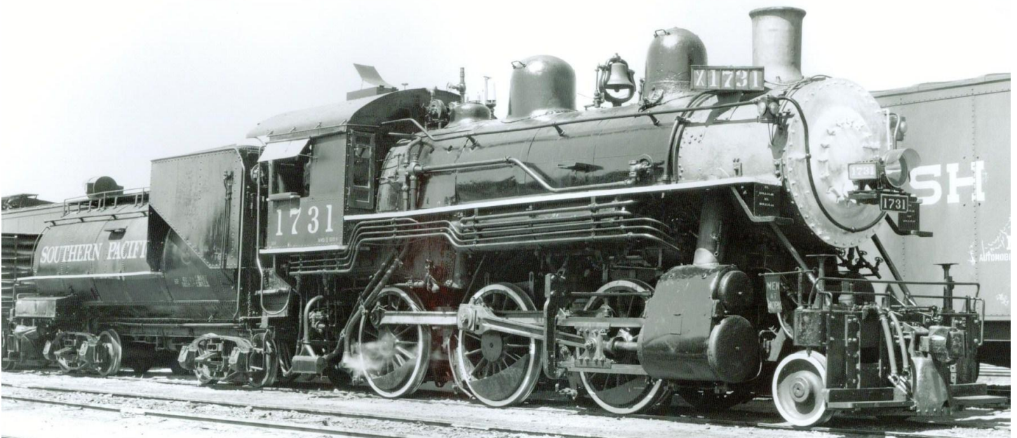
#1731 w/90-C-2 Tender – Roseville, CA 8/48 Guy Dunscomb

River Raisin Models has negotiated a small run of SP Moguls that will be imported along with the SP 0-6-0's. These models will be produced in four road numbers that will feature several different tenders and will include the features and quality that you have grown to expect from River Raisin Models. We have included the ability to order any locomotive with a USRA coal tender. A great freight or shortline passenger peddler for any railroad. See our website for updates to this project including photos and information. www.riverraisinmodels.com .