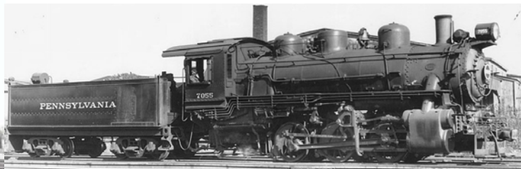
PRR with Clear Vision Tender