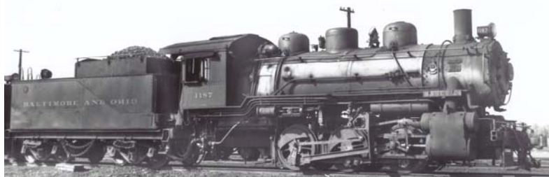
B&O with Clear Vision Tender

River Raisin will be importing these models for delivery in late 2011. These models will include the features and quality that you have grown to expect from River Raisin Models. The models will come DCC ready with a 9 pin wiring harness already installed. Check out website as more road specific information becomes available; www.riverraisinmodels.com , or call 248-366-9621 to find out more details.