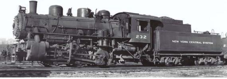
New York Central with Clear Vision Tender