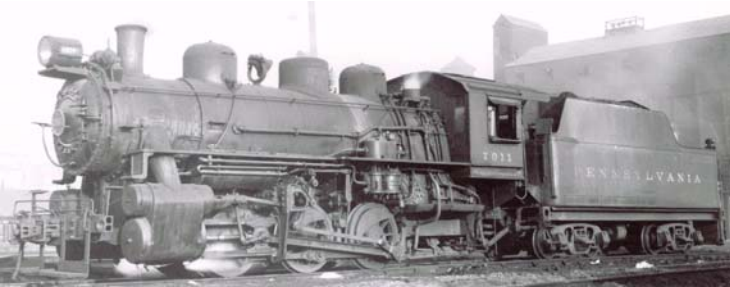
Pennsylvania Railroad with USRA Tender