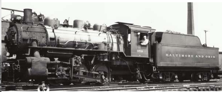
Baltimore & Ohio with Standard Tender