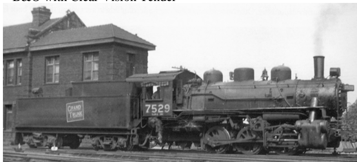
Grand Trunk with Clear Vision Tender