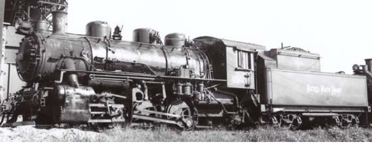
Nickel Plate Road with Clear Vision Tender